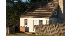
MCGULPIN HOUSE 1575 Fort Street