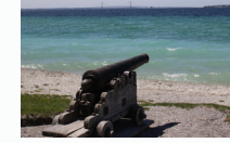
BRITISH LANDING BATTLEFIELD SITE (War of 1812)