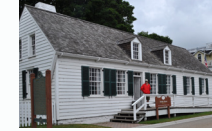
BIDDLE HOUSE 7406 Market Street