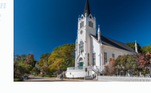
ST. ANNE'S CHURCH Main Street