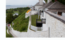
FORT MACKINAC 7127 Huron Road