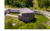
FORT HOLMES 2234 Fort Holmes Road