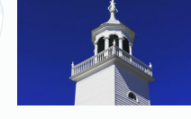
HISTORIC OLD MISSION CHURCH 6670 Lake Shore Drive