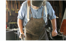
BENJAMIN BLACKSMITH SHOP 7406 B Market Street